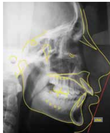
FIGURE 4 - E-LL line.