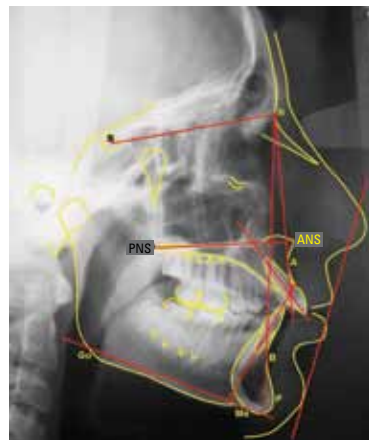
FIGURE 3 - SNA, SNB, ANB, H-Nose, N.NB, IMPA, 1.PP.